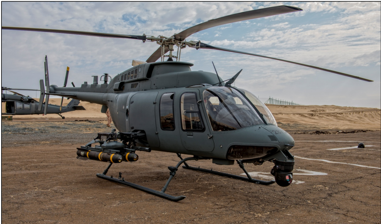
407 Series I Continuous Platform in aircraft shell

Cantine Armament Inc, proprietary rights are included in the information disclosed herein. Recipient by accepting this document agrees that neither this document nor the information disclosed herein nor any part thereof shall be reproduced or transferred to other documents or used or disclosed to others for manufacturing or any other purpose except as specifically authorized in writing by Cantine Armament Inc.