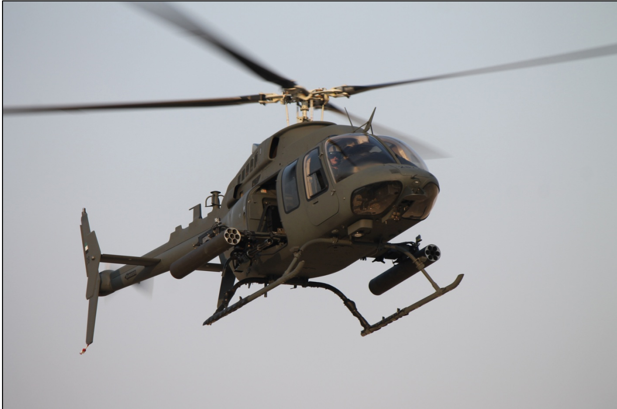
407 Series I MRH Platform

Cantine Armament Inc, proprietary rights are included in the information disclosed herein. Recipient by accepting this document agrees that neither this document nor the information disclosed herein nor any part thereof shall be reproduced or transferred to other documents or used or disclosed to others for manufacturing or any other purpose except as specifically authorized in writing by Cantine Armament Inc.