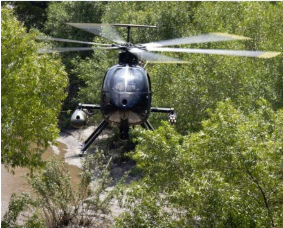
500 series folding platform in aircraft

Cantine Armament Inc, proprietary rights are included in the information disclosed herein. Recipient by accepting this document agrees that neither this document nor the information disclosed herein nor any part thereof shall be reproduced or transferred to other documents or used or disclosed to others for manufacturing or any other purpose except as specifically authorized in writing by Cantine Armament Inc.