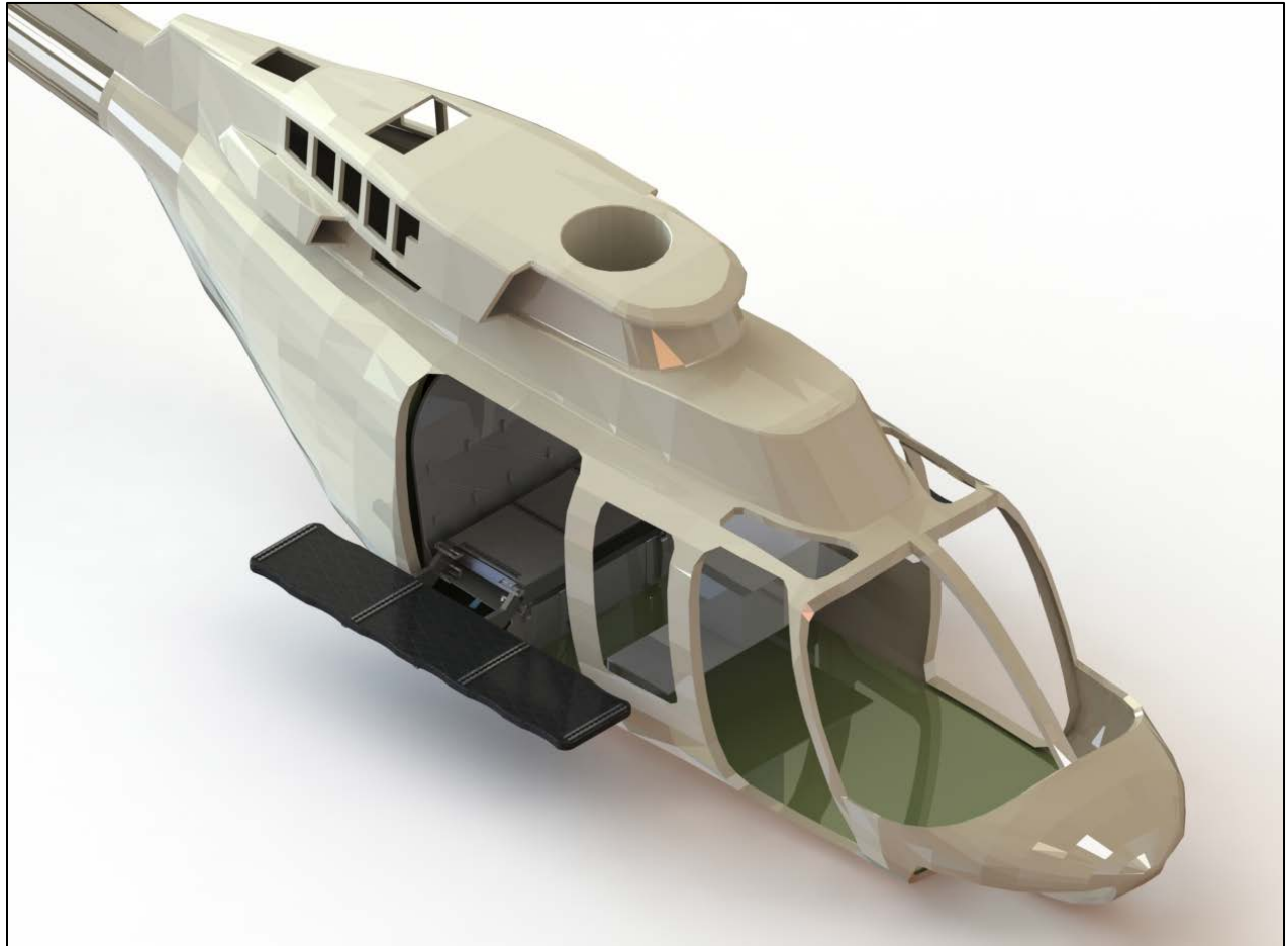
Tactical Assault Bench (TAB) on the BELL 407 Series II COMPOSITE BASED Folding platform in aircraft shell

Product Information – TACTICAL ASSAULT BENCH ATTACHMENT